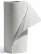
Paper Towels Need: (2) rolls