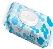
Baby Wipes Need: (2) pkgs