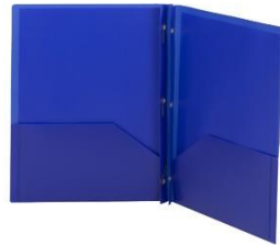
3-prong BLUE plastic pocket folder Need: (1)