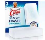
Mr. Clean Magic Erasers Need: (2) packs