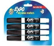
Skinny Black Expo Markers Need: (2) packs