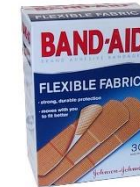
Band-aids Need: (1) box