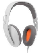
Headphones Need: (1) No earbuds Please label w/ your child's Name ☺