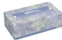
Tissues Need: (2) boxes