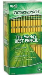
#2 Pre-sharpened Ticonderoga Pencils Need: (3) pkgs