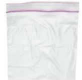
Baggies- Gallon Sized Need: (2) boxes