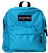
Backpack (No rolling backpacks please)